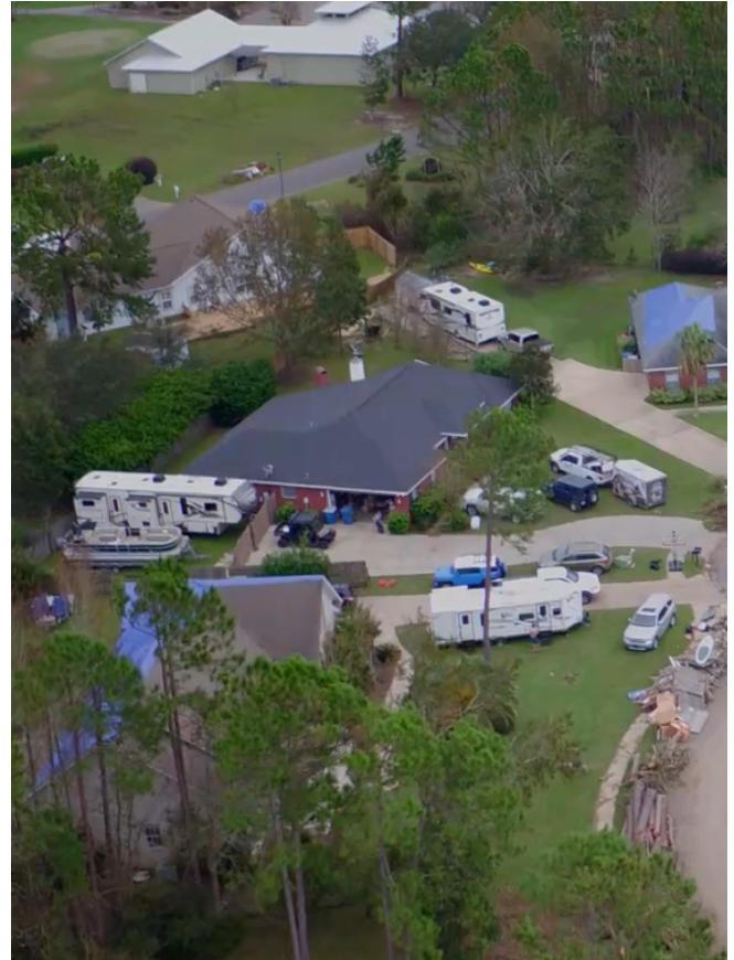
Real-world example of a FORTIFIED home after Hurricane Sally with no damage, while neighbors have roof and water intrusion damage.